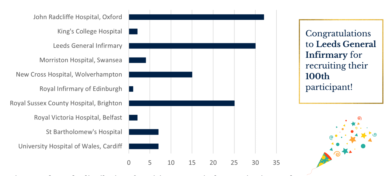
Figure 1: Shows the distribution of participants recruited across sites in March.