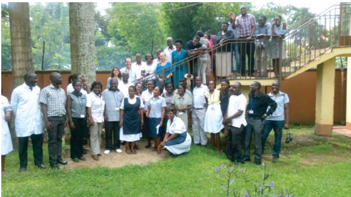
Right; Masaka and Below- Mengo