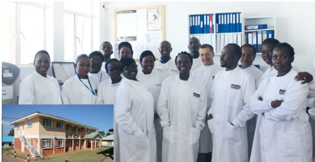
Part of the Lab team at the MRC/UVRI Entebbe campus. Inset; The new Laboratory buildings that house the CDLS

Following a rigorous process, the Clinical Diagnostics Laboratory Services at the MRC/UVRI Uganda Research Unit on AIDS was accredited with ISO 15189:2012 certification. Laboratory Accreditation provides both national and international formal recognition to competent laboratories, thus providing a bench mark for excellent performance. ISO 15189 :2012 is an important element in establishing and maintaining confidence as well as top notch quality in our laboratory diagnostic testing services.