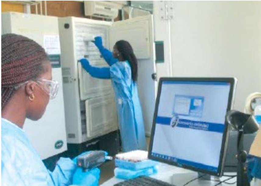
Repository staff entering samples using barcode reader in freezer works

Lastly, we are now registered members with ISBER (International Society for biological and Environmental repositories) a global organisation that fosters biorepository activities in bio banking and bio preservation as a research discipline.