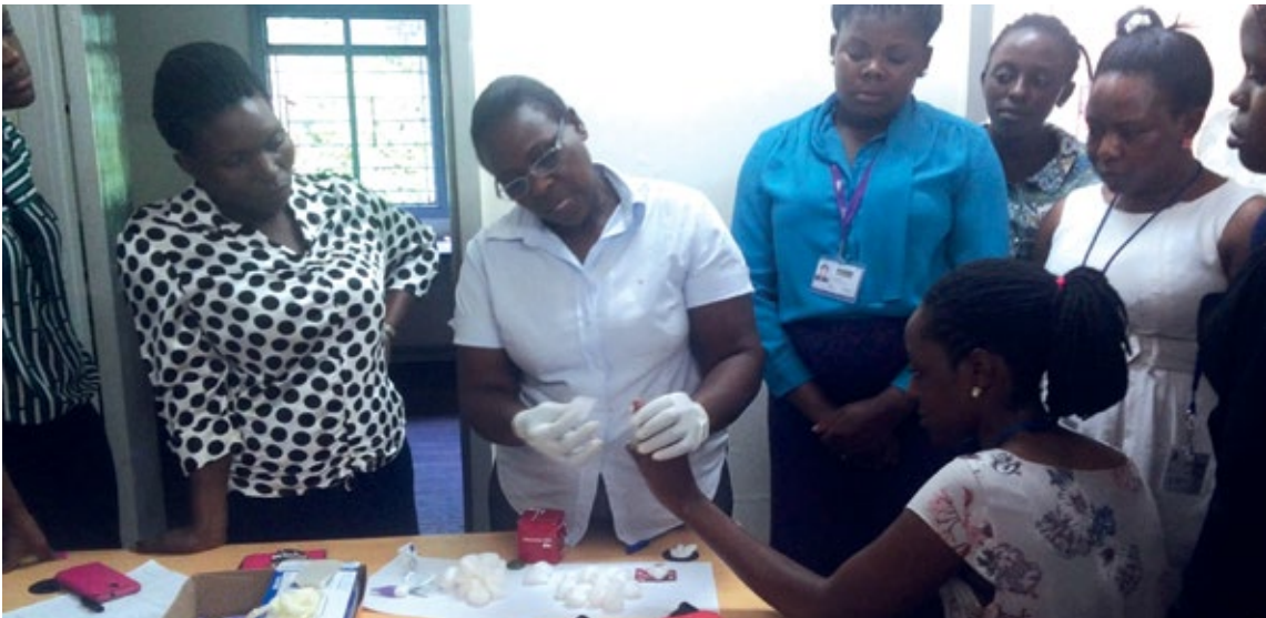
HSS Site Initiation visit: A Study Nurse on the Health Services Evaluation Study (HSS) conducts a Haemocue practicum, a method of determining blood sugar levels that will be used during the study. Looking on are the part of the HSS study team.

usually notifies the Principal Investigator (PI) of the need for a site initiation visit. The PI then takes on the responsibility of organizing the SIV. Collaboration between the PI and the CRC is important.