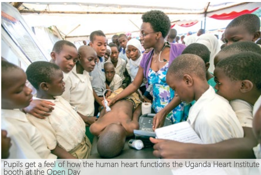
Pupils get a feel of how the human heart functions the Uganda Heart Institute booth at the Open Day

“The UVRI campus is home to very sophisticated labs, which have enabled us to conduct ground breaking research, that has contributed to informing policy formulation and implementation, not only in Uganda, but the region and internationally. Most of this would not be possible without the support of the government, through the Ministry of Health and our development partners. I however call upon the Government to increase the funding allocated to this work.”