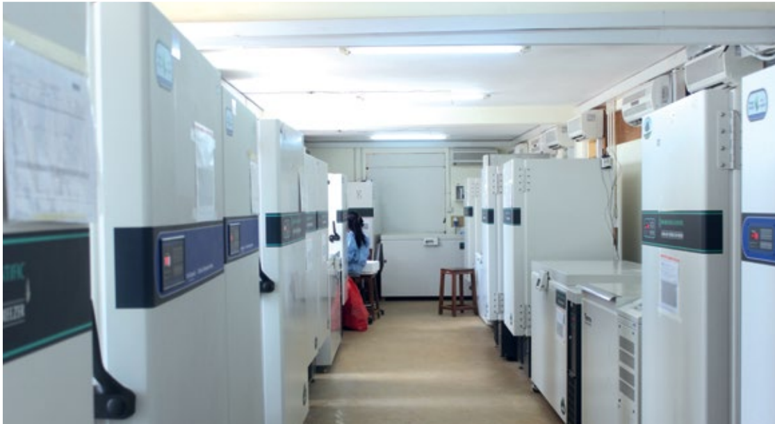
Entebbe; -80°C and -40°C freezers in which samples are stored in the New freezer room