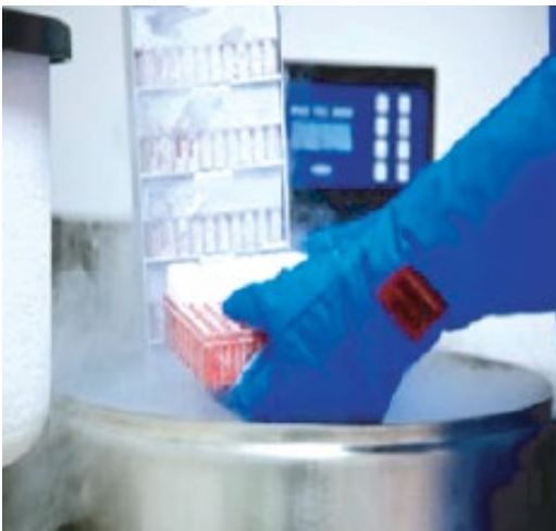
Sample storage in a liquid Nitrogen plant

laborating research laboratories either locally or internationally.