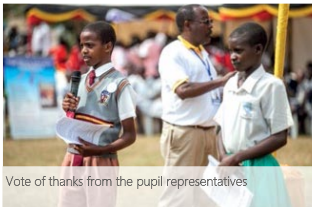
Vote of thanks from the pupil representatives

sity and tertiary institutions”. He pledged government support to promote the work done at the UVRI campus.