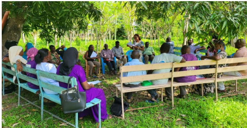
Community engagement session in Matsangoni, Kilifi County, Kenya