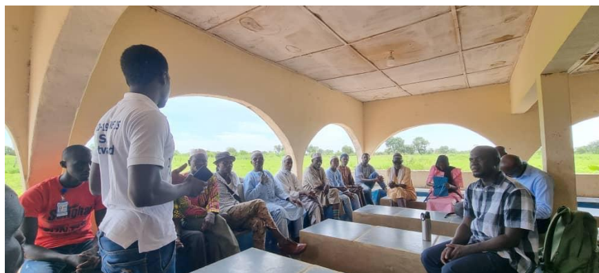
Community engagement session in Kiang, The Gambia