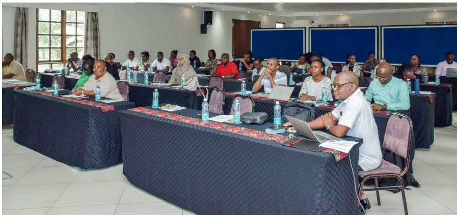
Members of WP1 and WP2 meeting with health managers from Kilifi County, Kenya, where they shared their implementation plans for proposed hypertension research work to be conducted across the county.

WP2 is currently involved in collecting blood pressure measurements from members of the community. This will be followed by collecting data on target organ damage at the IHCOR-Africa clinics in The Gambia and Kenya.