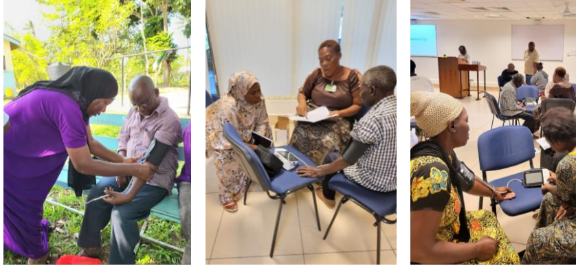
Community Health Volunteers (CHVs) being trained on consenting and use of blood pressure machines. The CHVs are then deployed in the community to assist in carrying out IHCoR-Africa research activities.