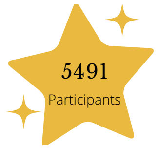
Number of participants recruited in October 2023 at each site