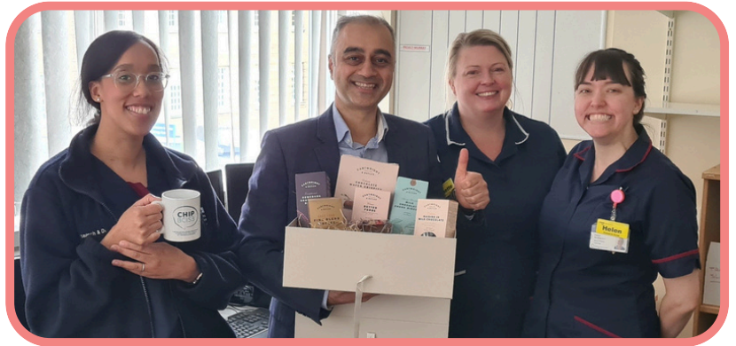
Queen Elizabeth Hospital, Birmingham