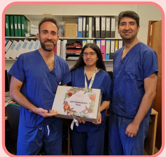
Harefield Hospital, London