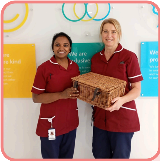
Freeman Hospital, Newcastle