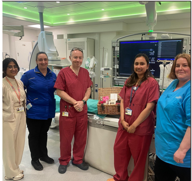
The team at Royal Bournemouth Hospital with their prize hamper - fantastic work!

QEH Birmingham Royal Bournemouth Hospital Bristol Heart Institute Golden Jubilee National Hospital, Glasgow