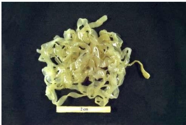
Figure 3 - Larval tapeworms from a case of sparganosis (2009).

If you are reproducing an image/photo/diagram/graph or similar from a public source, you should cite and reference it in the format relevant to the source you took it from – e.g. a journal-format reference for a graph originally published in a journal article; a web-format reference for an anatomical diagram you found on the internet. For example, an image taken from LSHTM's digital asset management system Asset Bank might be cited as: